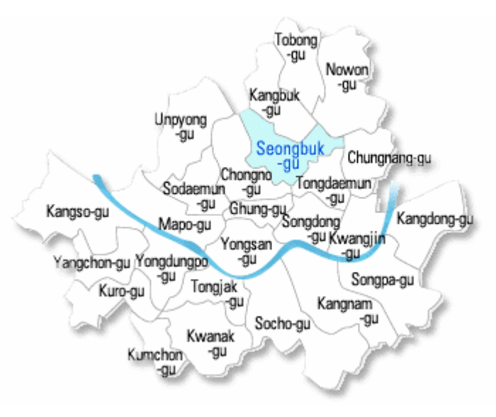
Chart 1. Map of Seoul

To the west of the region is Bukhan-san, and to the east is Jungnang-cheon at the border of the region. The northern border has Jeongneung-cheon and Wui-cheon that stem from Bukhan-san, and the southern region is bordered by Dongdaemun District. The outer region of the old capital of Seoul has characteristics of a transition area, which contains Dobong, Nowon, and Jongno regions on its outskirts. It's located at the center of a strategic axis that links the northeastern region of Seoul (Dobong, Uijeongbu, and Dongducheon) to the urban center.