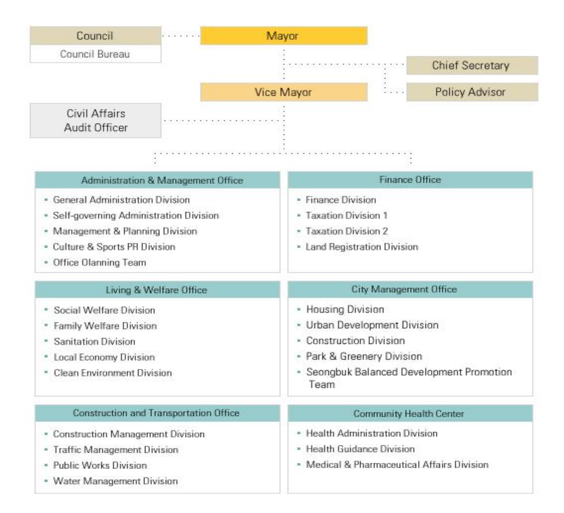
Chart 3. Shows the administrative organization of the District Office