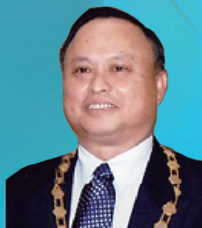
Hon. James Chan Khay Syn Mayor of Council of the City of Kuching South, Sarawak, Malaysia