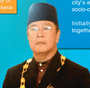
Hon. Haji Mohamad Atei Abang Medaan Mayor of Kuching North City Hall, Sarawak, Malaysia