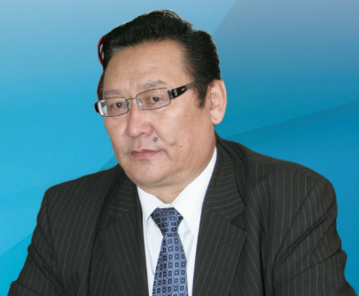
Hon. Bilegt Tudev Governor of Ulaanbaatar City, Mongolia