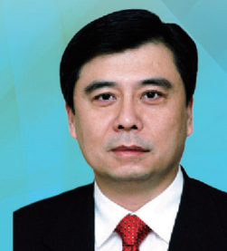
Hon. Yan Li Mayor of Suzhou City, China