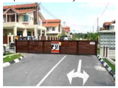
Taman Country Vale, Jalan Stephen Yong, an example of community and private sector participation

introduced and accepted by the residents. It is a joint effort between the developer, CJK Development Pte. Ltd. and the Council. Country Vale Garden comprises 22 units of double storey terraced houses, 6 units of double storey semi-detached houses and 1 unit of double storey detached house. It is a racially mixed housing estate. A (Residential) Development and Security Committee had