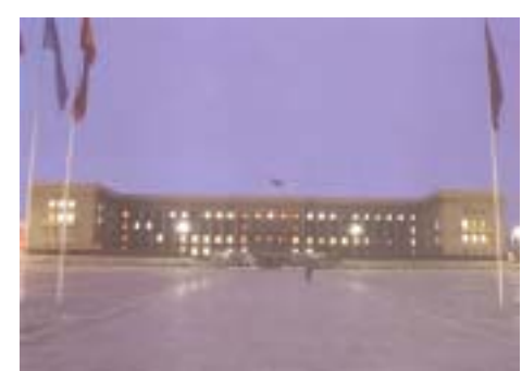
Ulaanbaatar Healthy City's approach is providing a model for cities in Mongolia and beyond.